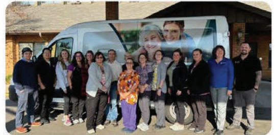
The Riverside Emergency Response Team

Thank you to the Riverside team for sharing your story!