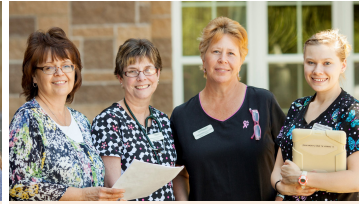
Employee Recognition Fund