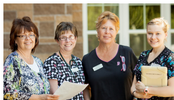
Employee Recognition Fund