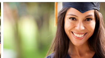
Tuition Incentive Program