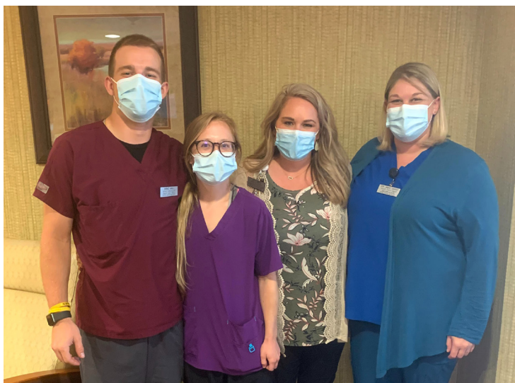
From Left to Right: