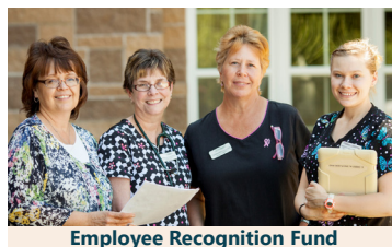
Employee Recognition Fund