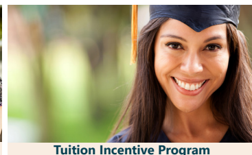
Tuition Incentive Program