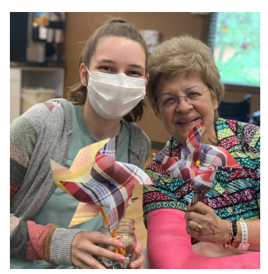
Creating fun crafts wiht the recreation therapy team at Riverside Transitional Care!