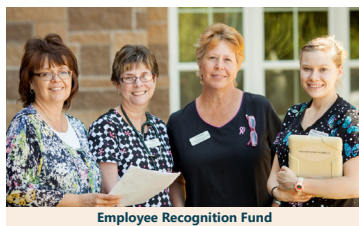
Employee Recognition Fund