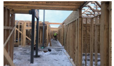
Area A ~ 1st Floor