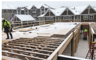
Area A ~ 2nd Floor