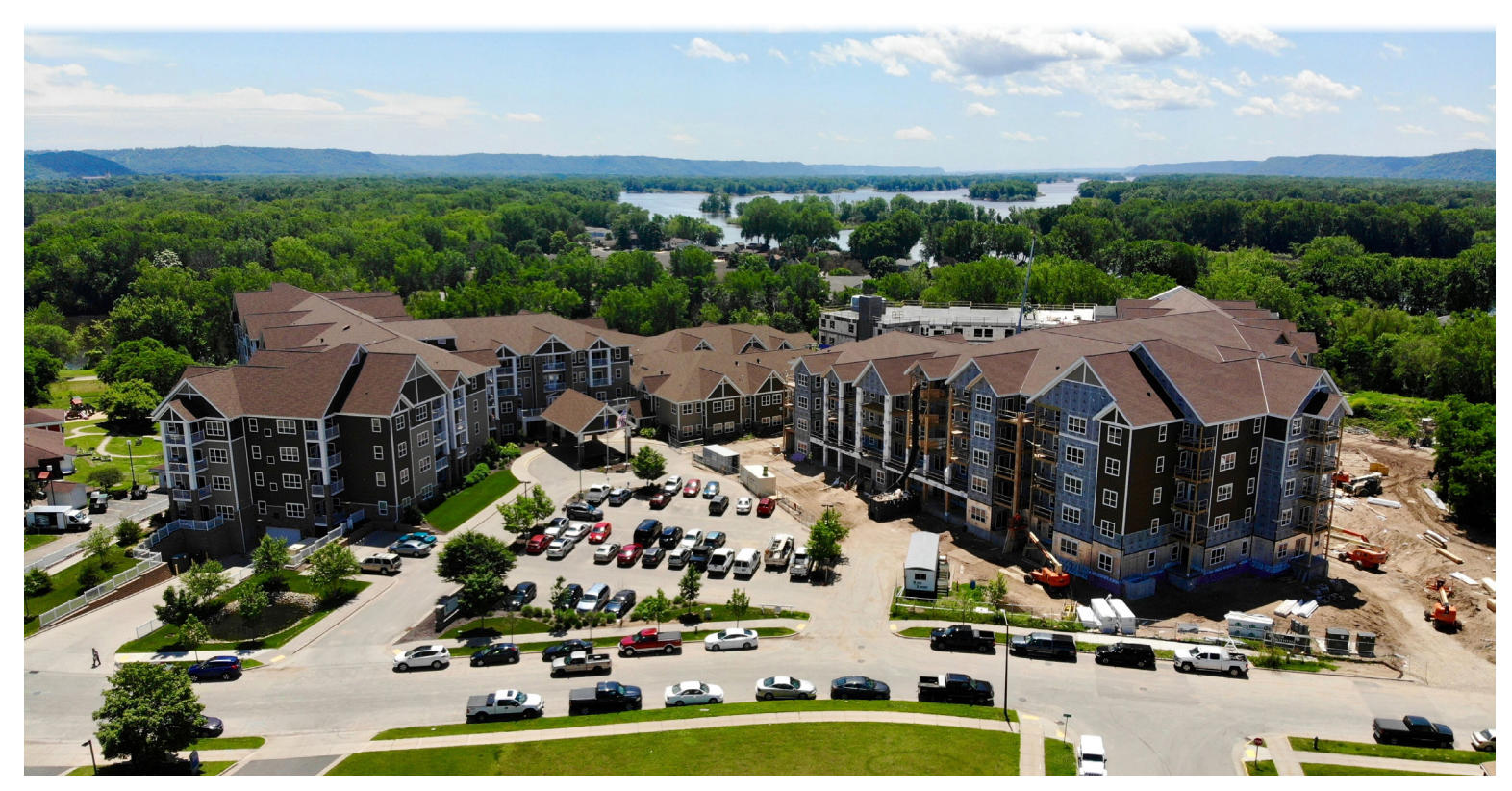
Eagle Crest South Expansion - Opening Spring 2020

The integration of the bluffs and river enriches Eagle Crest's sense of community. The fluid lines of the river and bluffs flow seamlessly into the soaring eagle. This represents the connections between Eagle Crest Communities and the Coulee Region, as well as the smooth transition residents will experience upon moving to one of our communities.